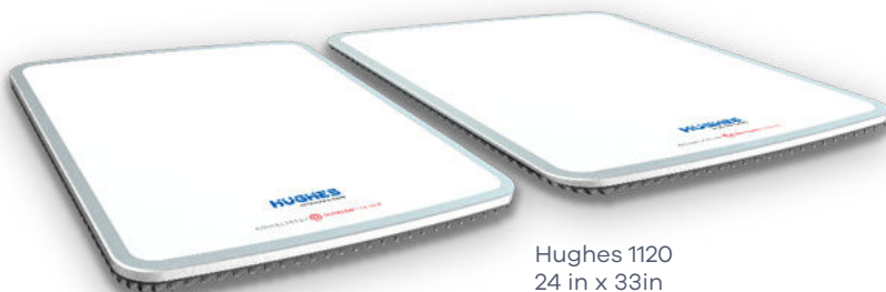
Hughes 1120 24 in x 33in

The FlexEnterprise portfolio, including solutions leveraging both LEO and GEO (geostationary orbit) connectivity, helps you streamline operations and deployment processes thanks to simple end-terminal subscription plans, uniform performance across the global FlexEnterprise GEO and LEO footprints, and enterprise-grade support. It's now easier than ever to make your network nimble and scalable, delivering a new level of reach, performance, and flexibility to support critical applications and drive business productivity.