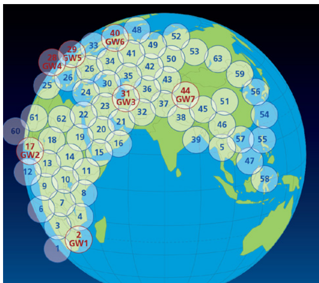
Fig. 1: IS-33e Ku-band User & Gateway Beams