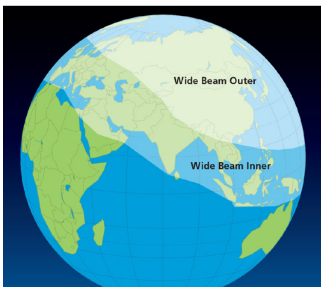
Fig. 2: IS-33e Ku-band Wide Beam