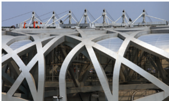
The "Birds Nest," Beijing National Stadium